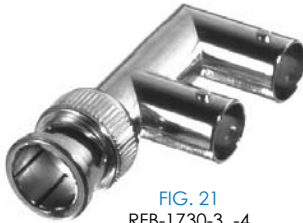
FIG. 21 RFB-1730-3, -4