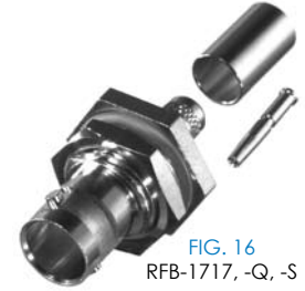
FIG. 16 RFB-1717, -Q, -S