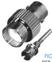
FIG. 26 RFB-1745