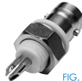
FIG. 15 RFB-1716-1