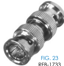
FIG. 23 RFB-1733