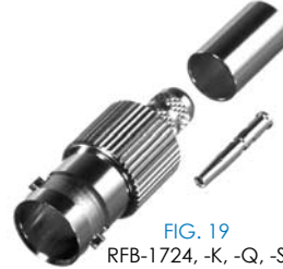
FIG. 19 RFB-1724, -K, -Q, -S