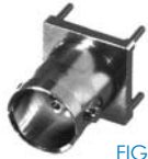
FIG. 13 RFB-1715-11