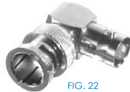
FIG. 22 RFB-1732