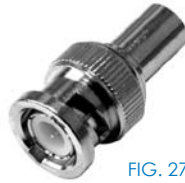
FIG. 27 RFB-1750