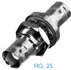
FIG. 25 RFB-1735, -I