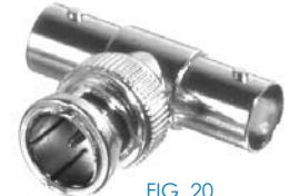
FIG. 20 RFB-1730