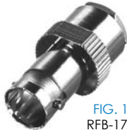
FIG. 17 RFB-1720