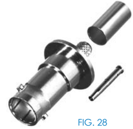
FIG. 28 RFB-1760

PHOTOS FOR REFERENCE ONLY, SHOWN AT 100% ACTUAL SIZE.