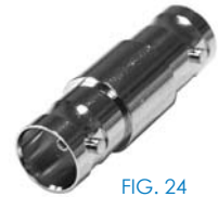
FIG. 24 RFB-1734, -2

PHOTOS FOR REFERENCE ONLY, SHOWN AT 100% ACTUAL SIZE.