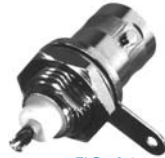
FIG. 14 RFB-1716