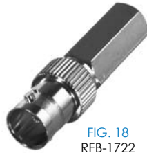
FIG. 18 RFB-1722